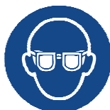
Tightly sealed goggles