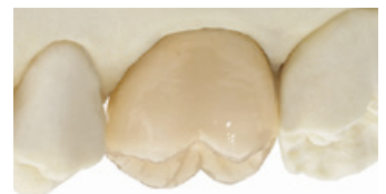
Step 4: Shade body, incisal staining, glazing finish