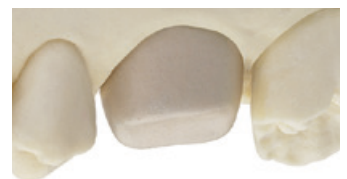
Step 2: Tooth coloured INSPIRATION opaquer paste