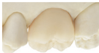
Step 3: Body material